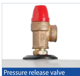
Pressure release valve